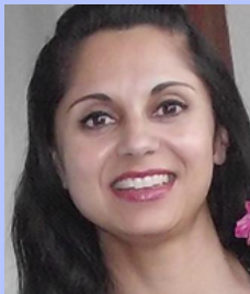
Kuljit Sehmi Logo Synthesis